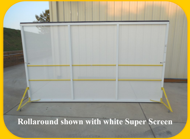
Rollaround shown with white Super Screen