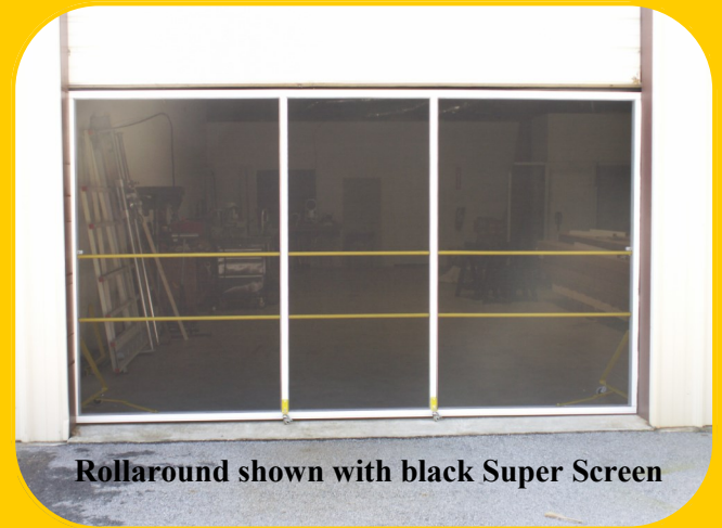
Rollaround shown with black Super Screen