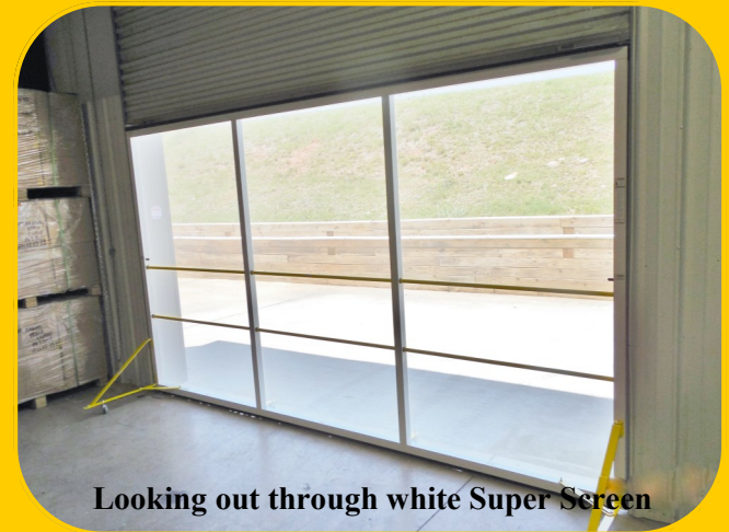
Looking out through white Super Screen